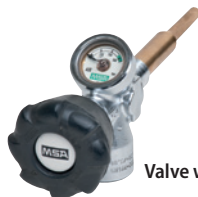
Valve with Gauge